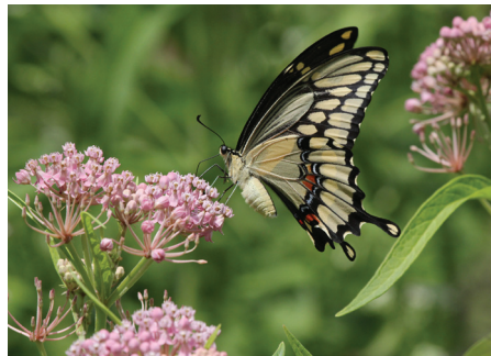
Giant Swallowtail gathering nectar from a Swamp Milkweed Flower at Depot Park Rain Garden

habitats and ecosystems. The nursery is open April through September and plants are available at the Missoula Farmer's Market or local nurseries. Contract growing available.