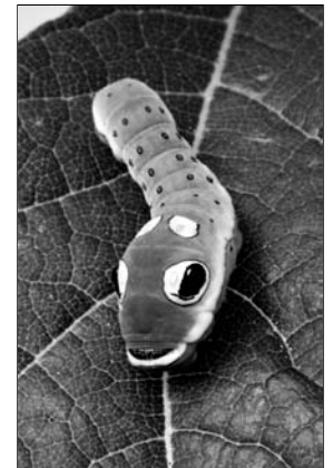
Spicebush swallowtail caterpillar on spicebush leaf.