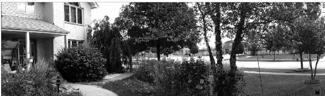
Residential landscape.