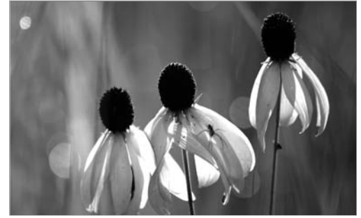
Yellow coneflowers.

There are many ways to help Wild Ones promote environmentally sound landscaping practices to preserve biodiversity through the preservation, restoration and establishment of native plant communities.