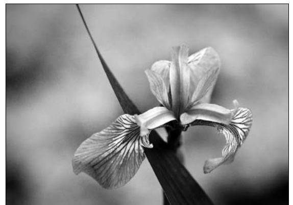
Southern blue flag iris.