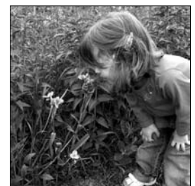
Sometimes you have to stoop and smell the spiderwort.

Citizen's Natural Resources Association Community Foundation for the Fox Valley Region: Environmental Stewardship Fund