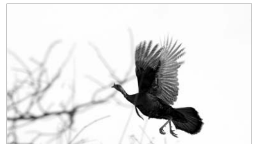
Wild turkey flying.