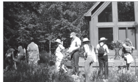
2010 Garden Tour.

There are many ways to help Wild Ones promote environmentally sound landscaping practices to preserve biodiversity through the preservation, restoration and establishment of native plant communities.