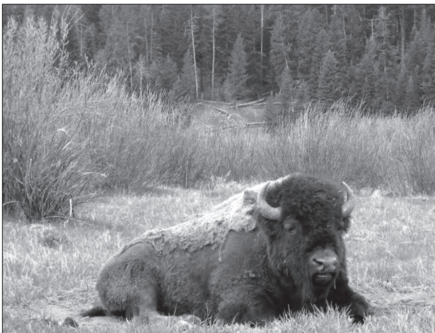
Slough Creek Bull.