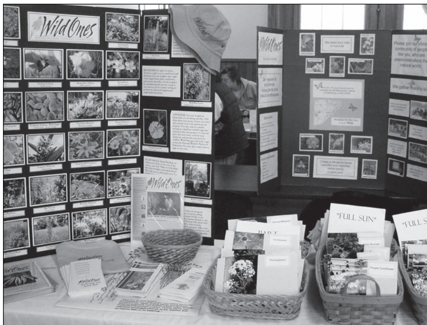
Community Seed Swap.