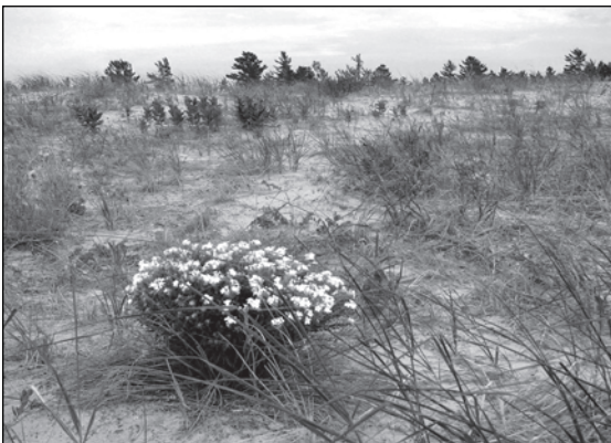
Puccoon on Lake Michigan Dunes.