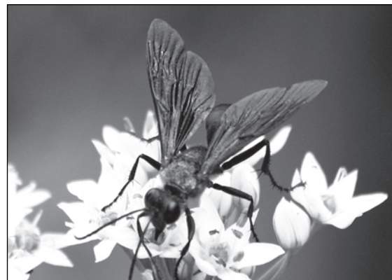
Black Flower Wasp.