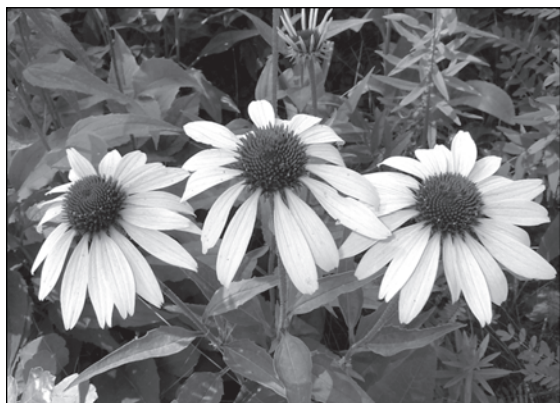
Three Purple Coneflowers.