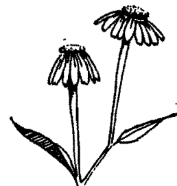
PURPLE CONEFLOWER Echinacea purpurea PRAIRIE Bold reddish purple 'petals' around a deep red central disc. These sturdy wildflowers with vigorous foliage grow 2 to 3 feet tall and withstand drought well. A sun-loving perennial.