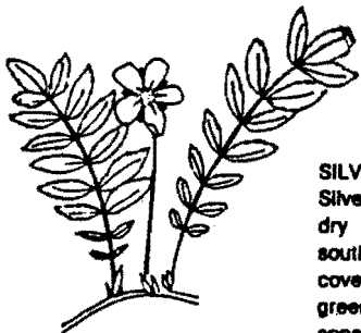
SILVERWEED Potentilla anserina