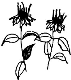
WILD BERGAMOT, BEEBALM Monarda fistulosa PRAIRIE A wild mint with dense heads of pinkish to pale lilac blossoms that appear in mid-summer. The leaves and flowers give off a pungent aroma when crushed — some people use it combined with other herbs in tea. This wildflower likes sunny spots or sites with very light shade. Perennial.